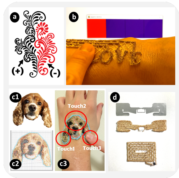
Figure 3: SkinLace applications (a) PCB design for SkinLace (b) four letters as capacitive touch electrodes, (c1-3) image for customized SkinLace, conversion into stitches, and fabricated result with three touch points, and (d) UHF RFID tag and NFC tag.

SkinLace can work as a textile-based on-skin PCB, which provides opportunities to enhance both functionality and aesthetics. Unlike other types of smart textile PCB, SkinLace is free from the fabric as it is not a part of another fabric structure (e.g. woven, knit, felt), nor dependent on another supportive fabric (e.g. stitch, embroidery, silkscreen). It forms its own structure with freedom in shape and porosity, and does not get loose in edges. This feature allows SkinLace to conform to the 3D shaped body surface unlike other fabrics that need darts or finishing on the edge. It also increases permeability that polymer-based on-skin devices cannot provide, and decreases weight of the device and the material/production cost. Another advantage comes from its aesthetic potential. Web-like motif pattern of lace allows a complex and elegant circuitry. Figure 1a is a simple example of SkinLace PCB inspired by a bridal lace glove. It manipulates a floral lace pattern for a soft circuit